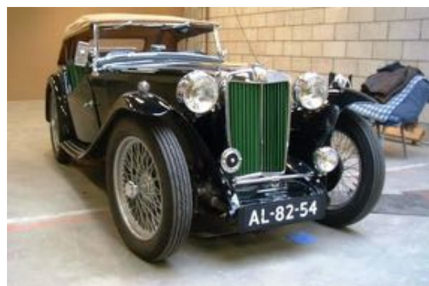
Fig 3 The TC as rebuilt by Wim Crouwel