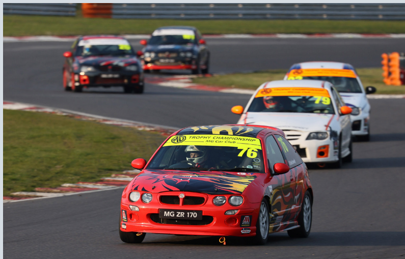
Grid Positions &amp; Results - Race 3