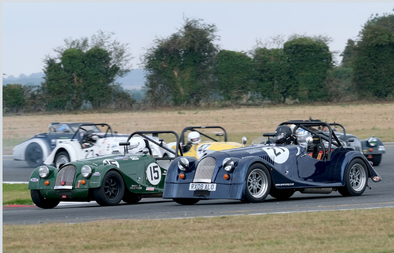
Grid Positions & Results - Race 6