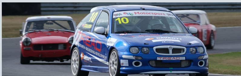
Grid Positions &amp; Results - Race 2