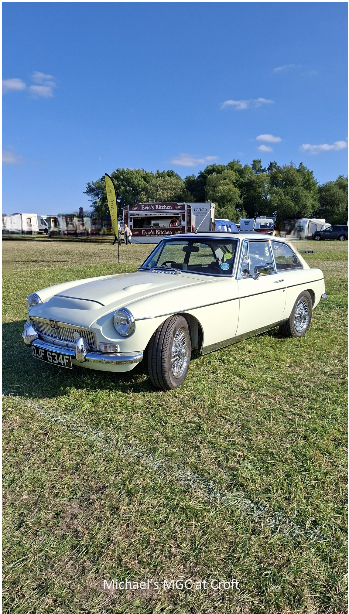
Michael's MGC at Croft