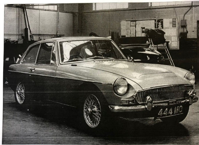
The Austin-Healey 3000 Mk. IV prototype of 1966, codenamed ADO52, shows the attempt to marry the distinctive Austin-Healey 3000 grille with the nose of the MGB. Donald Healey would not sanction the use of his name on this car and so it was abandoned.

There appears to have been some suggestion that it was the Healey MGC GT prototype (codenamed ADO52) above.