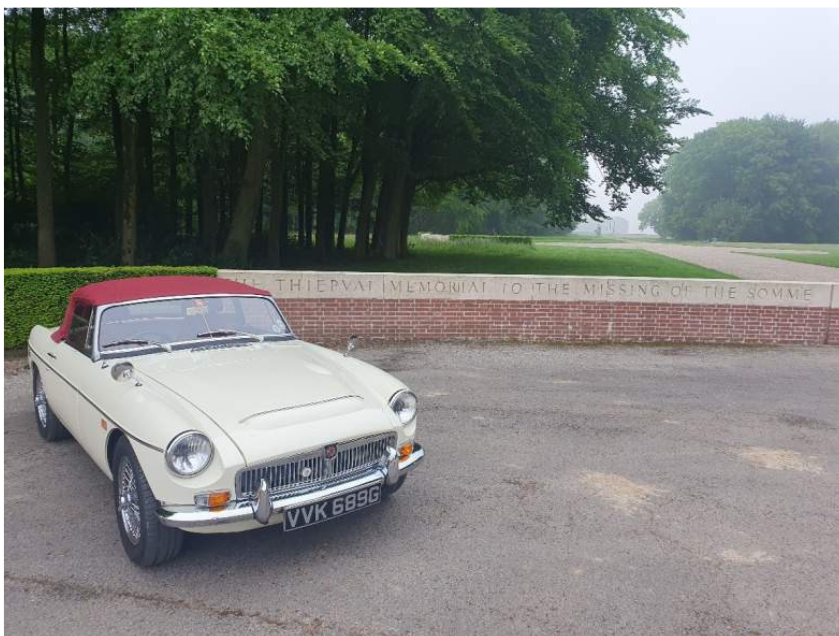
My MGC roadster at Thiepval

South Africa, Australia, New Zealand, Canada, India and so on. As I gazed out over fields full of red poppies, a shotgun fired from time to time (presumably a bird scarer) and I was truly humbled.