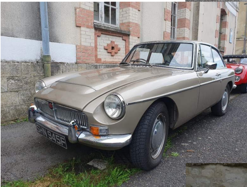
MGC GT (sadly, owner not known)