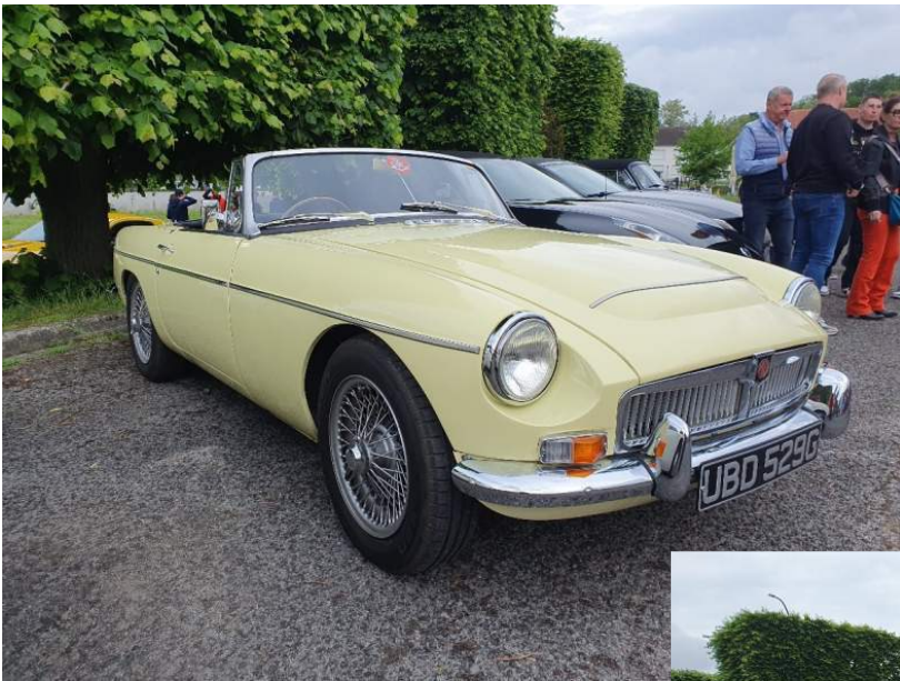
Simon Milner's MGC roadster