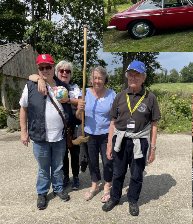
Above at the vineyard Coffee/lunch stops