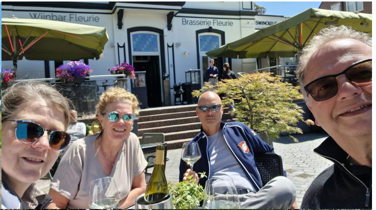
A losing golf team!