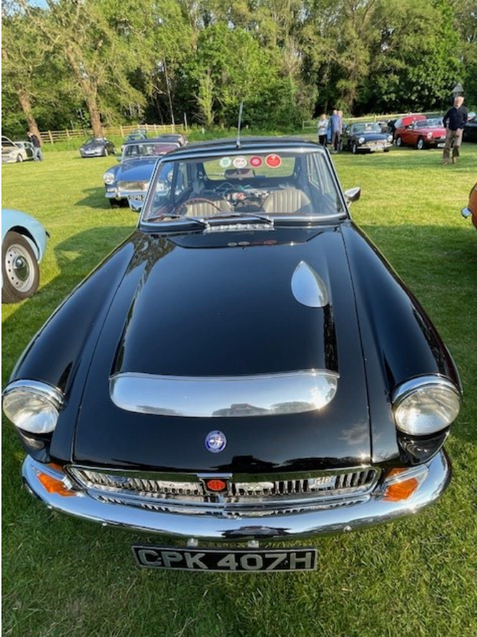
Chris Noulton's UM CGT

The following day we were at Brooklands and some of us tried 'The Hill', here are some of the photos.