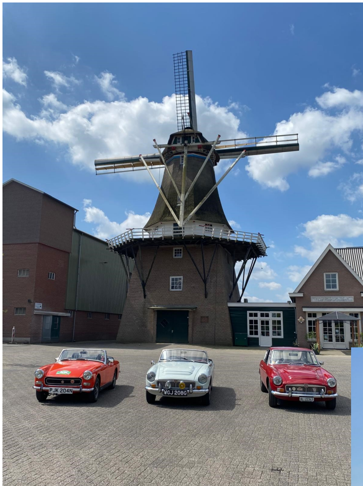
Of course we found windmills.