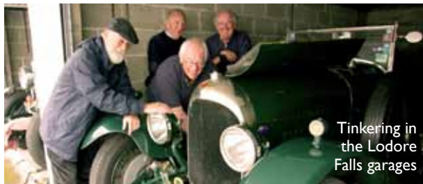
Tinkering in the Lodore Falls garages

Our 6 family owned and run hotels are the ideal base from which to explore the Lake District. Being close to iconic routes such as Honister and Kirkstone Pass, the beautiful valleys of Borrowdale and Eden, and the famous lakes of Ullswater and Derwentwater, ensures that we offer not only excellent hospitality, but also an understanding of what you - the classic car owner - are looking for.