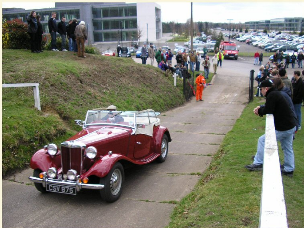
Alan Wakefield and "Matilda" storming up the Brooklands Test Hill