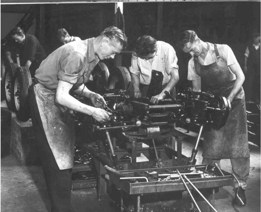
TD SUB-ASSEMBLY LINE AT ABINGDON IN THE EARLY 1950s - almost certainly, long before bike computers were invented!

[* Note:- The “rolling circumference” turns out to be mid-way between the circumferences of the “unloaded” tyre and that calculated using the radius at the flat bit with the car weight on it. So don’t rely on your calculator too much. Physical measurement of one rotation is what counts.]