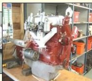
XPAG engine rebuilds. 3 year warranty