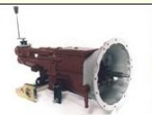
5 Speed conversion