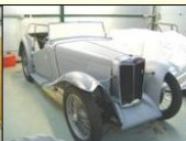
T Type restoration