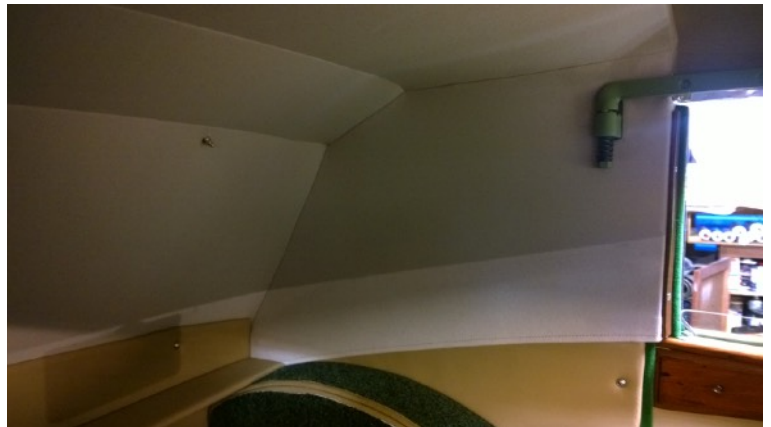
The fully-lined interior

He had done a good job and the car now looked like a Tickford should. There is no doubt that the hood is a key component of the Tickford cars.