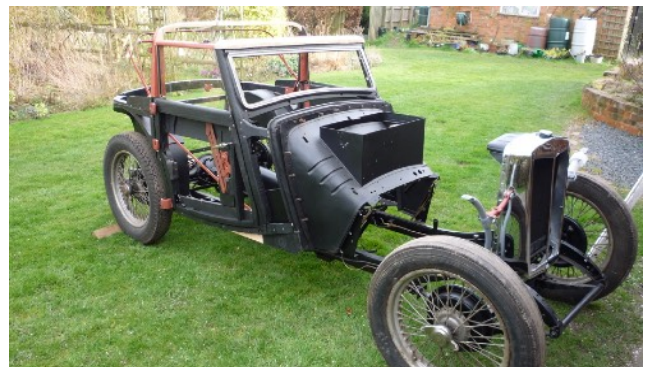
The body frame nearly finished, just the third hood bow to make

In 2014 I felt the body was ready to be skinned and I looked for a specialist who could undertake the work, preferably not too far away so that I could keep an eye on it and sort out queries if they arose. I