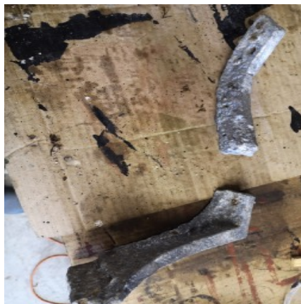
An old rear body bracket