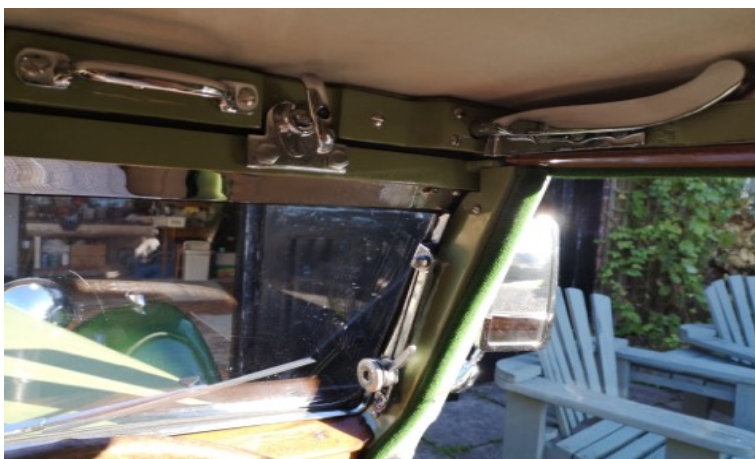
Some of the chrome parts associated with the windscreen and hood

During this time I had also sorted out most of the parts that might need new chrome work. As well as the usual headlights, radiator surround and so on, the Tickford has a wide array of various hood parts that need chroming as well as a comprehensive windscreen frame and brackets and catches that allow it to open from the top – all of