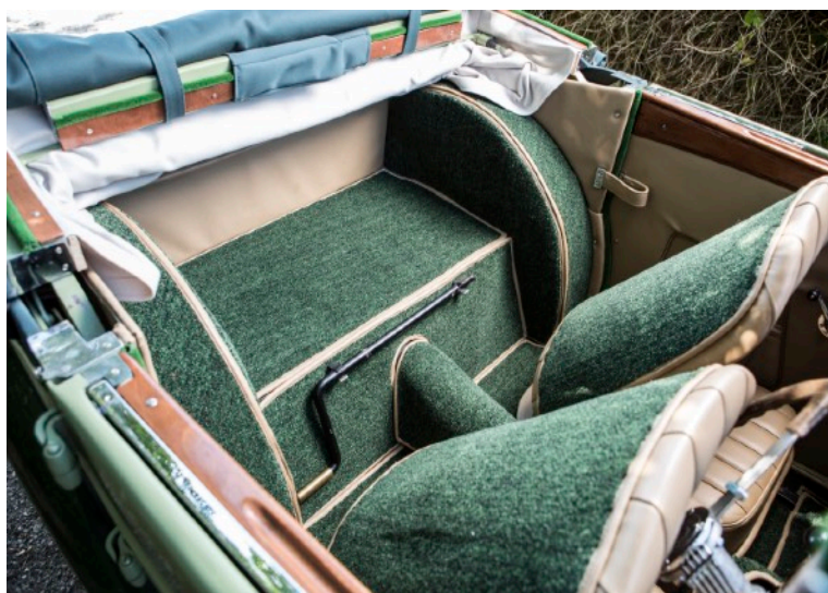
Interior trim behind the seats

Apart from the seats and door cards my car was missing all the interior trim. There are trim panels around the rear of the car and there are carpets covering the rear wheel