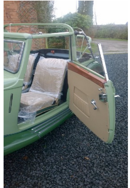
Newly trimmed seats and door cards

brush dynamo I decided to fit LED bulbs wherever possible. After much research I managed to find suitable bulbs for the panel lights, the interior light, front and rear sidelights and brake lights and the headlights. They reduce the load considerably and are brighter at the same time than the originals. I managed to wire up the indicators in such a way that the trafficators work in unison with the front and rear orange flashing indicators. The arm comes up and the bulb flashes in line with the others, a bit