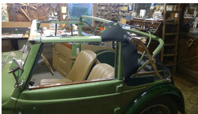
Setting up the hood bows and tension wires for the hood prior to cutting out the fabric.