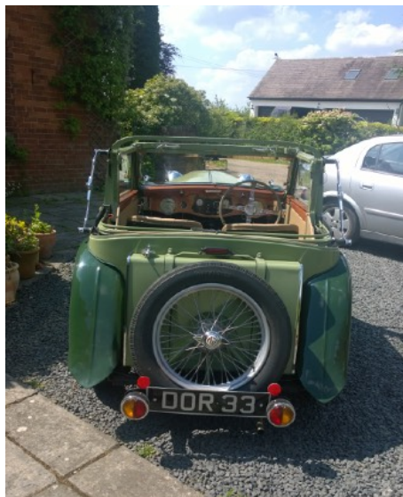
A photo showing the rear light set up including the high level brake light

like a side repeater. I also decided, in the interests of safety, to fit an extra high level brake light and chose a simple LED one mounted above the petrol tank. It is bolted to a stepped aluminium bracket that is clamped under the fuel tank straps. In this way no extra holes had to be drilled anywhere. The original indicator switch was similar to those found on Morris Minors and positioned to the right of the Speedometer. My car had always had a stalk indicator switch fastened to the steering column and I opted to keep that as more practical and use the hole for the indicator switch for a water temperature gauge.