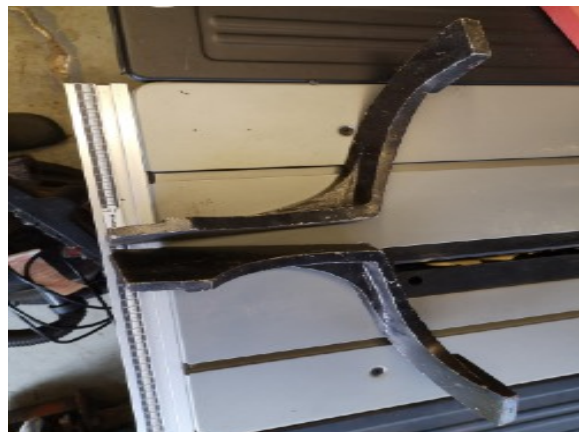
A pair of new aluminium body brackets

Progress then slowed down. The Tickford has two key brackets that form the curves at the back of the body tub bolted to the metal sub frame. These are made of aluminium and the brackets on my car had almost corroded away because when you have steel and aluminium in contact