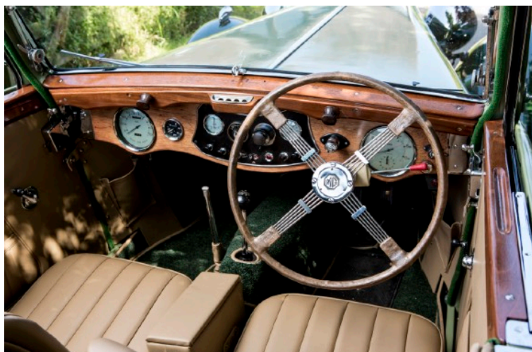
Front interior trim