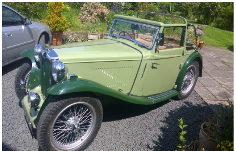
The car with painted tub and panels