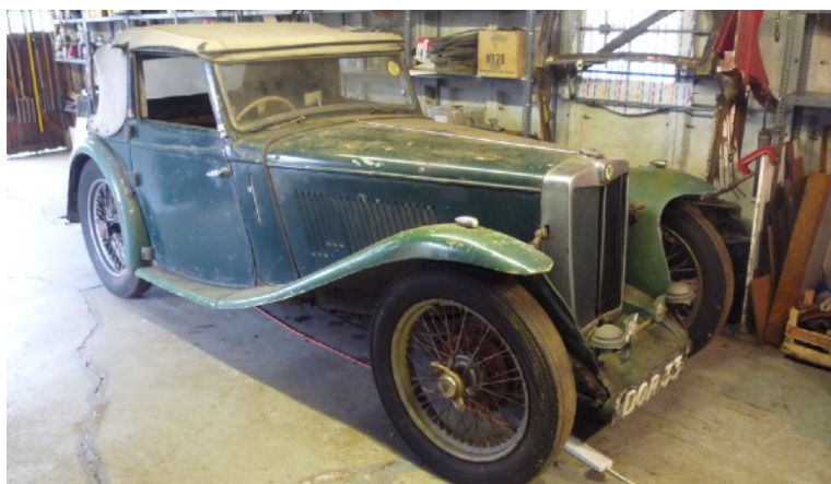
This is the car before it was dismantled in 2010

Between March and October 2010 I completely stripped the car down to bare chassis level. The chassis itself was sound apart from needing some repairs to the rear body mounts, repairs to the battery carriers and a new front pin for the rear spring hanger on the offside. I repaired these bits myself and then had it shot blasted, primed and painted in satin black. I got a local engineering shop to make me up a new pedal shaft drilled and tapped for a grease nipple so that I can lubricate the pedals.