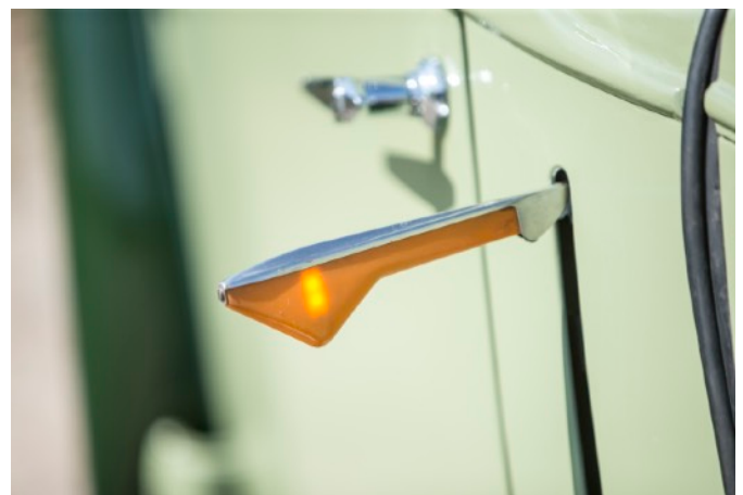
The trafficator acting as a side repeater

The Tickford has the same electrical set up as the standard car with the addition of semaphore style trafficators fitted just in front of each door, an under-bonnet wiper motor driving individual wipers via a series of cranked arms under the dash and an interior light fitted on the hood bow just above the rear window. So I installed the new looms – both the dash and main loom – and first of all wired up the dash and fitted all the instrument panel lights. I then added extra wires for the trafficators, the wipers and the interior light. To reduce the load on the old third