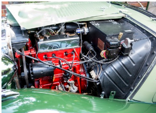
The under-bonnet wiper motor next to the control box

In terms of the electrics I had been thinking about the main elements for a while. In the main I have tried to keep the car as original as possible except where it was either safer or more practical to change things. I tried to adopt the same approach with the electrics. So I have kept the original third brush dynamo and CJR3 control box, the original distributor, coil and fuel pump and kept it all positive earth. The original wiring loom was only good as a pattern as was the dash loom. So I bought a new loom for a positive earth TA from Autosparks with built in flashing indicators and this included a new dash loom.