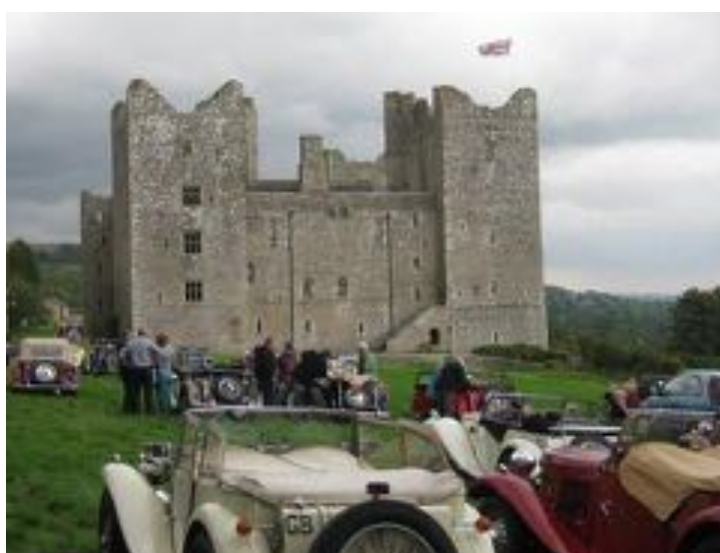
LUNCHTIME STOP AT BOLTON CASTLE ON SATURDAY