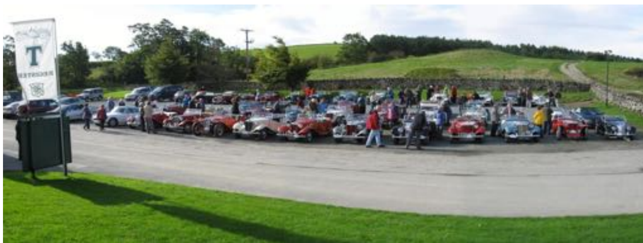
THE ASSEMBLED T TYPES