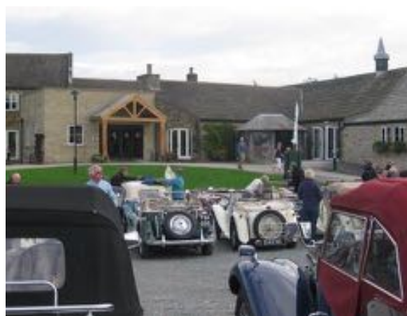
WILL IT RAIN TODAY?