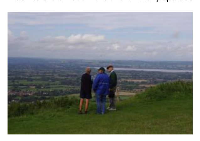
"that be Wales over thore"

Then further east as far as Tetbury and then north to Nailsworth a lively artistic town in a wooded valley with numerous small interesting shops and eating establishments and subject to a series of manoeuvres and backtracking around roundabouts by T Types much to the amusement of the local populace.