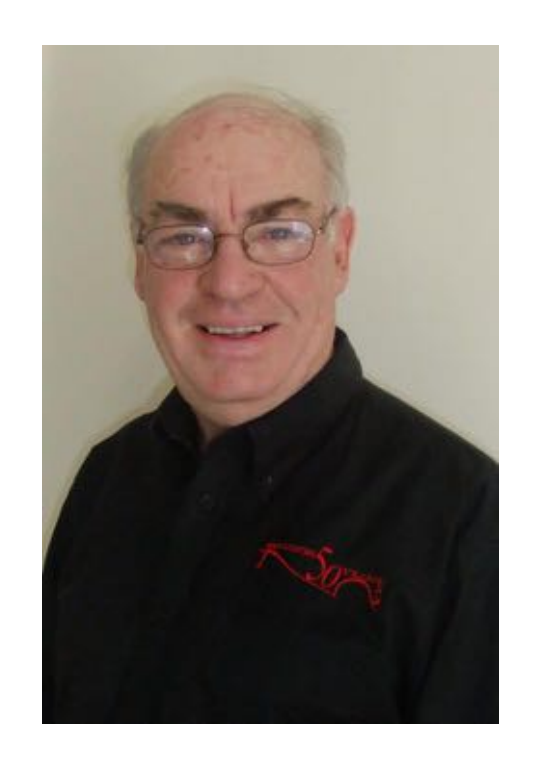
TRN APRIL 2013