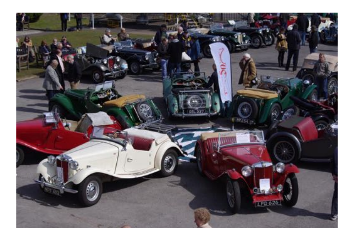
Stern to stern, the T Register Octagonal Display at Brooklands MG Era Day