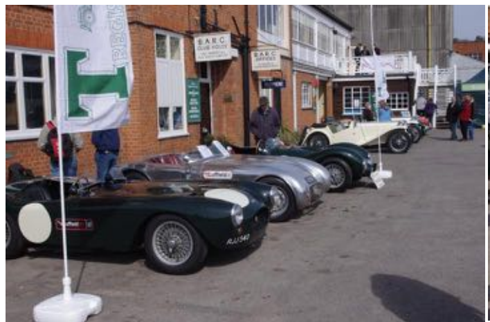
.....the Luffield sposored T Type specials were also well represented.