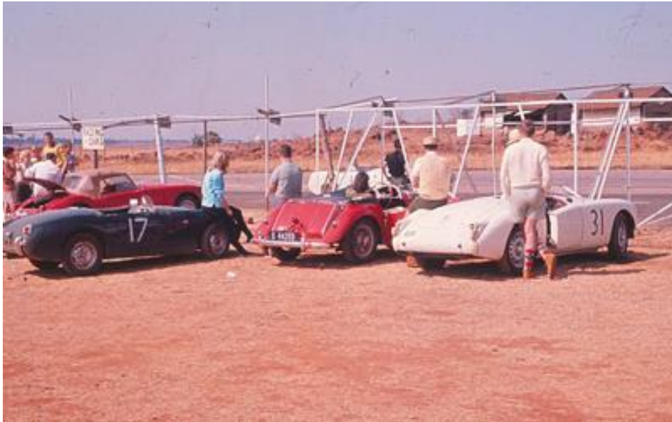
Marlborough track in about 1961

When I acquired YD2 2387 from Andre Meyer in 1998, it was partly dismantled, but very original and unrestored. The bronze paint was faded and peeling but there was no rust and no damage to any of the body panels. The engine had been newly overhauled with new, high compression pistons and the indicated mileage was 60k miles. The radiator, grille and hood frame were missing, but the original factory hardtop was still present. I started collecting all the necessary parts for a full restoration, but because it was such an easy restoration, I started tackling a long series of more challenging projects and only completed the restoration in 2019/20, before moving the car to Knysna. The colour was returned to the original old English white, with the panels painted separately by Colin Osborn in Johannesburg.