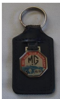
Club Key Ring