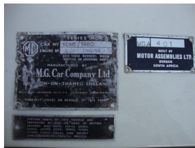
The original YDH5 1480 Vin and ID plates.