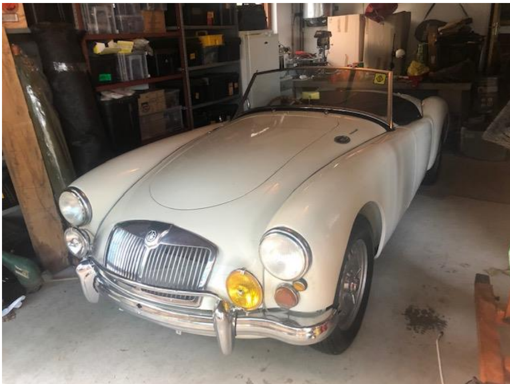
In Knysna, December 2019