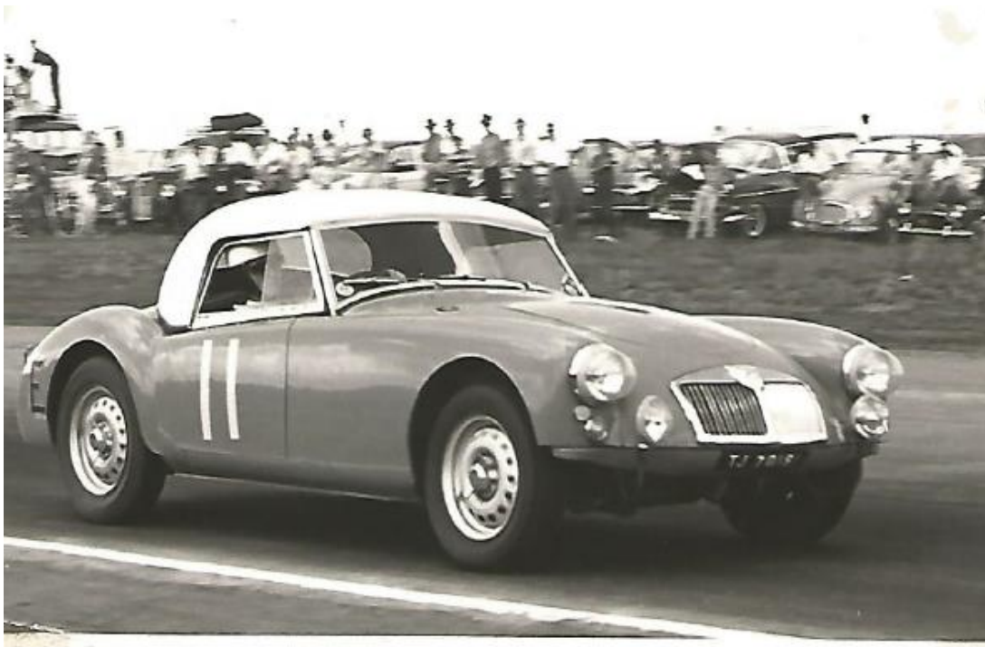
The 1961 Kyalami 9 hr.(ref Sun on the Grid page 153)