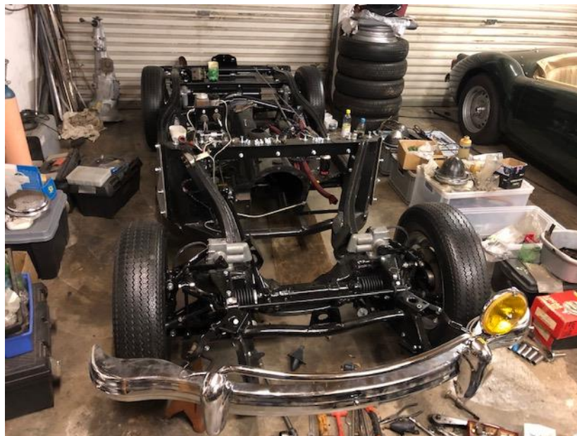
Rolling Chassis, Fourways July 2019

When I acquired YD2 2387 from Andre Meyer in 1998, it was partly dismantled, but very original and unrestored. The bronze paint was faded and peeling but there was no rust and no damage to any of the body panels. The engine had been newly overhauled with new, high compression pistons and the indicated mileage was 60k miles. The radiator, grille and hood frame were missing, but the original factory hardtop was still present. I started collecting all the necessary parts for a full restoration, but because it was such an easy restoration, I started tackling a long series of more challenging projects and only completed the restoration in 2019/20, before moving the car to Knysna. The colour was returned to the original old English white, with the panels painted separately by Colin Osborn in Johannesburg.