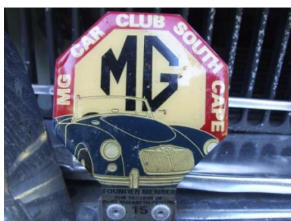
Official Club Bumper badge