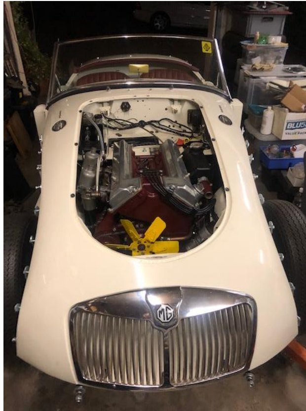
Fourways October 2019