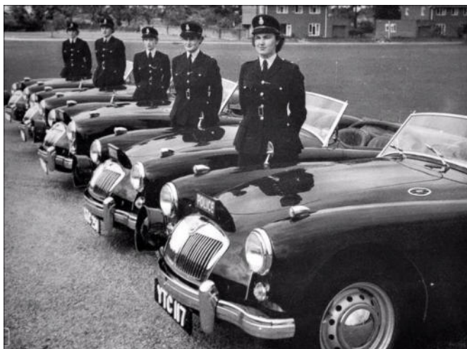
All Low Mileage – one owner - one lady driver Lancashire Constabulary Vehicles

Col Cleaver. NSC cleaver@bigpond.net.au or 0419 772 554