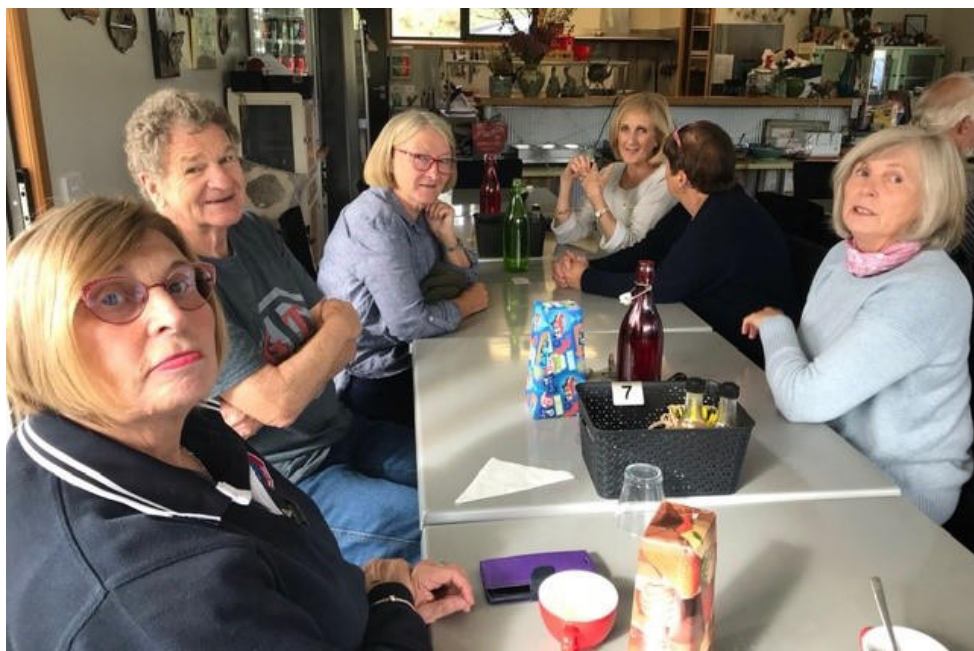
Southern Sub-Centre members enjoying the mid-week run.