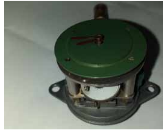
Clock in a classic Smith Jaeger Rev. Counter Clock removed showing white balance wheel

The actual clock movement is extremely well made and withstands the test of time remarkably well. It is the pin function that fails, but a company in the UK manufactures an electronic module to replace the pin and contact bit which can be fitted with a reasonable amount of dexterity. The screws are very small and fat fingers need to be quite nimble to manage it, but it can be done. This kit is available from Clocks4classics.