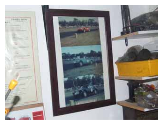
Poster of 9hr racing – Black Mamba lowest.

Black Mamba, not yet licensed for road use, shares a boat shed with an equally immaculate Twin Cam Roadster. In a boat shed next door is an M chassis and another racing Twin Cam Coupe in the process of restoration. (The progress here will be interesting to watch as Bo is planning to bring her back to life as a Knysna Hill Climb special.) Black Mamba's racing history is distinguished as she was actually a 1958 pre-production model raced in the 9hour endurances races at the time as an advertisement for the Twin Cam models and did very well. Bo's restoration has produced a perfect copy of what she was in her prime and I was privileged to be taken on a circuit around Belvidere Estate, with a crisp exhaust note from the side mounted exhaust pipe to make room for a bigger than normal fuel tank. Bo had to be careful about noise and speed bumps so we never got out of second gear, but in view of the reputation Twin Cams have of being difficult to drive I was impressed by her tractability under Bo's skilled hands.