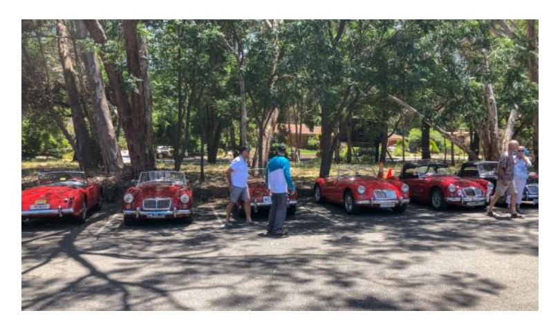
MGA Register Run