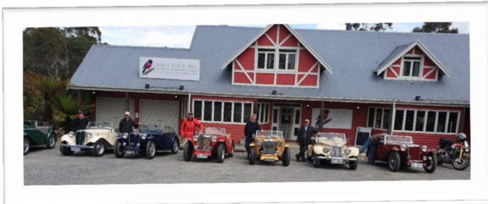
T's at Moina Coffee Break