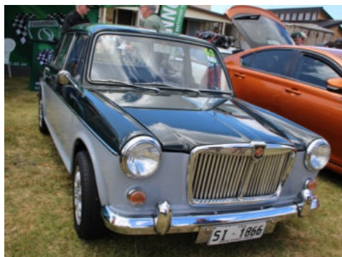
Bronwyn Zube's 1100