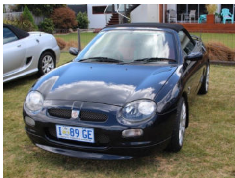
Sue-Anne Midgley's F Trophy 160