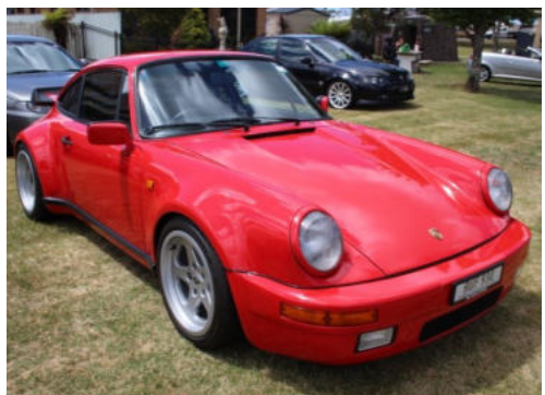
Jim Brown's Porsche 930