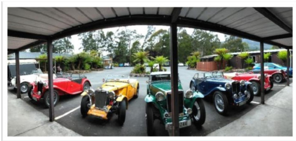
T's bedded down for night at the Tullah Lakeside Lodge