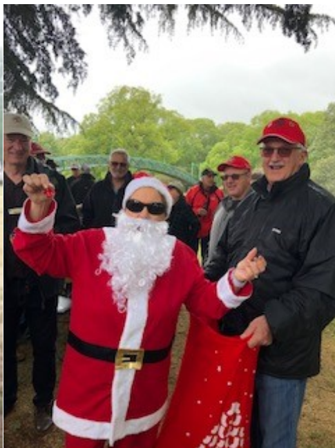
Here comes Santa.