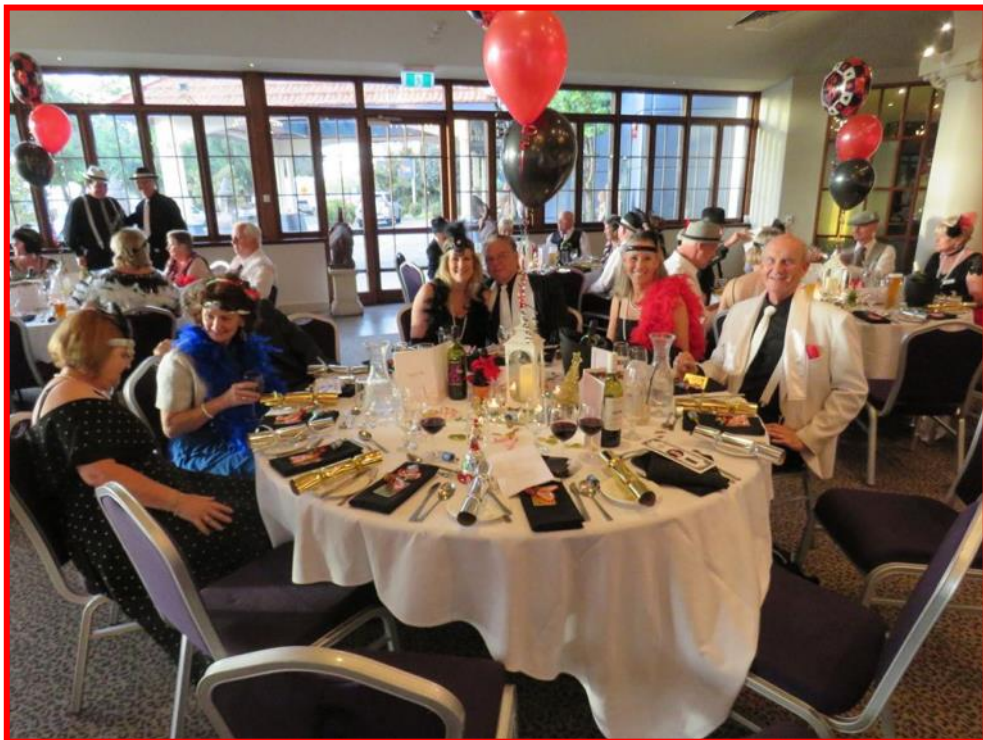
Early part of the evening with guests just starting to arrive.