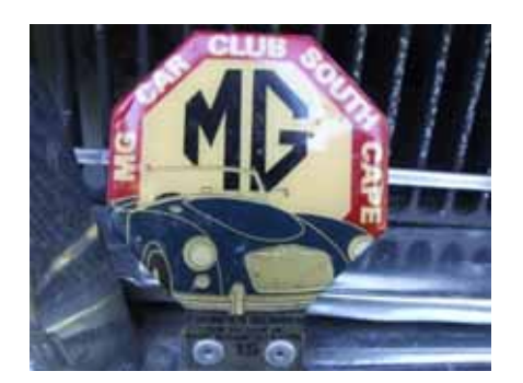
Club Key Ring