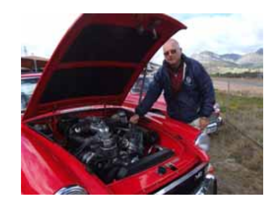
The Costello as posed by Cheryl