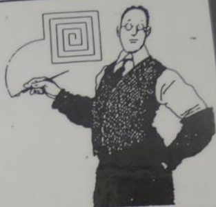
MURPHY'S BEST FRIEND WAS A COMPUTER.

A meeting is an event at which the minutes are kept and the hours are lost.