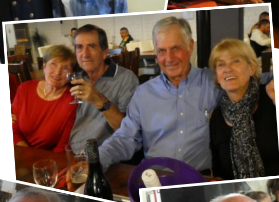
A fun night was had by all.