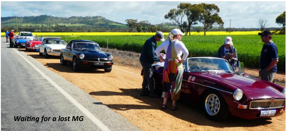
Waiting for a lost MG

We continued through York and stopped at the turnoff to Meckering to regroup. However, a green MGF was seen flying past the turn off and despite frantic waves we went unseen. A phone call was made but truly, how many of us can hear our phones ring above the roar of a sports car.