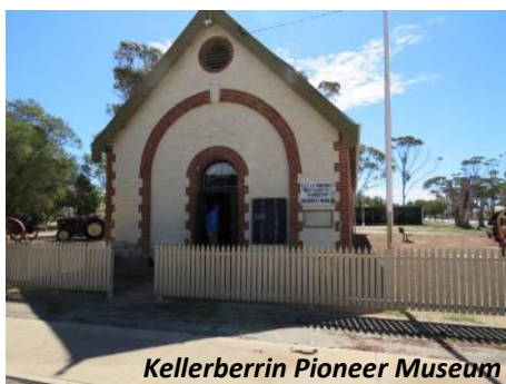
Kellerberrin Pioneer Museum