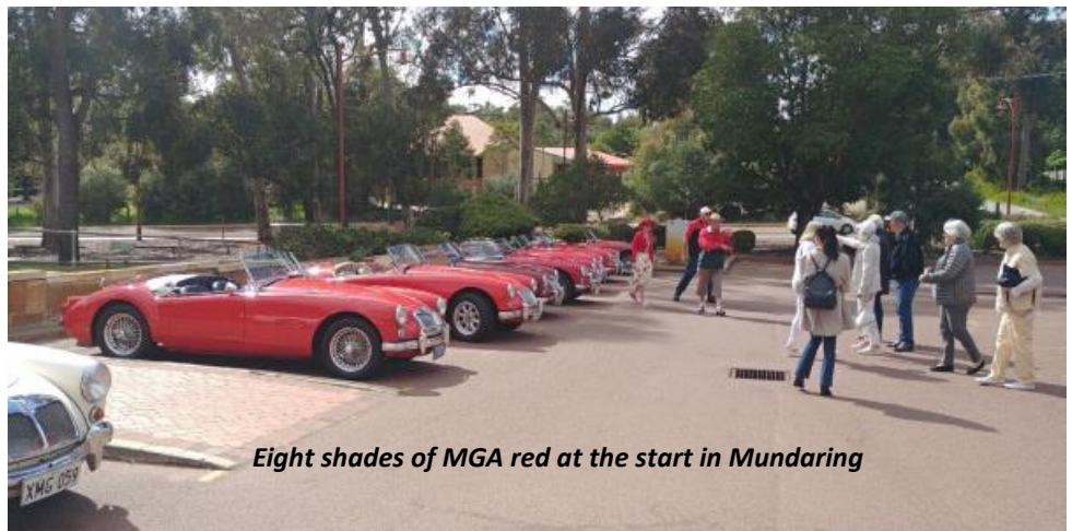
Eight shades of MGA red at the start in Mundaring

This being a fine Sunday, the motorcyclists were out in force