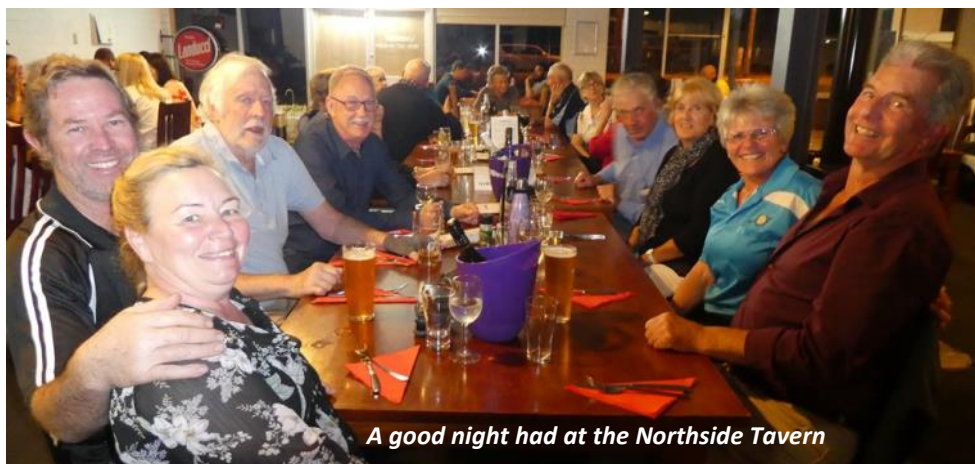
A good night had at the Northside Tavern