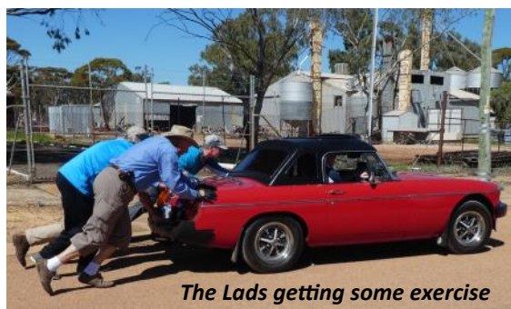
The Lads getting some exercise

Having spent an enjoyable hour looking about it was time to head to Nungarin but before leaving town we did a tour through the industrial area – OOPS! Wrong way, turn back and now we are on a gravel road, where are we going I ask myself. Oh, there's the sign Merredin Peak Reserve and Railway Dam. Up the steps we climbed to the banks of the dam. A stone wall and channel was built all the way around the rock so that rainwater could be collected in the dam and then pumped over to the hospital and railway station. We hadn't got very far on the next leg of this trip, when Ernie and Lyn Whitehurst's MGB came to a halt and it turned out to be a starter motor problem. So, a few able bodies gave them a push start, and this had to be done every time they stopped the car. At least they were able to continue the journey with us all.