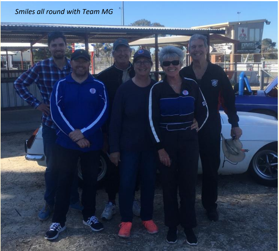
Smiles all round with Team MG