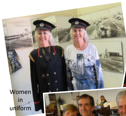
Women in uniform