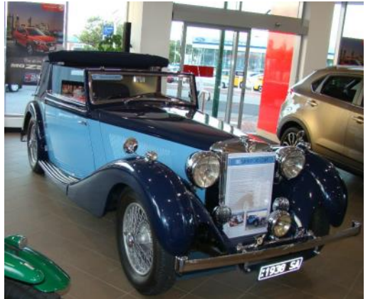
Two of the older MG's on display at the promotion of the new MG release in WA