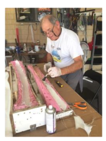
Fig 24 (left) first a gel coat, then three layers of fiberglass cloth

Fig 25 (right) two halves of header rail with embedded steel anchor points for fabric rail and jarrah blocks for clamps