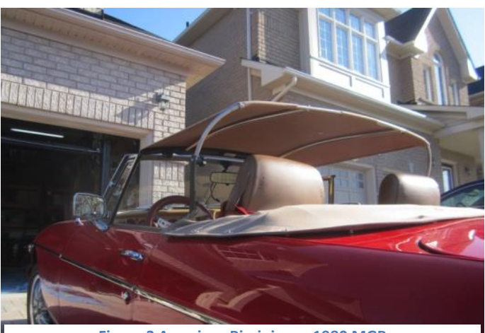
Figure 3 American Bimini on a 1980 MGB

Later I saw an article on an MGB "Bimini Top" [MG Driver Nov/ Dec 2012]. It looked like a promising solution to an ongoing problem: I want the top down whilst Patty wants the top up!