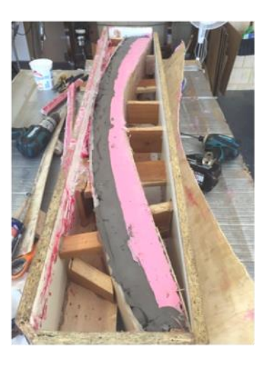
Fig 13 Donor rail held in place with modelling clay, one side poured