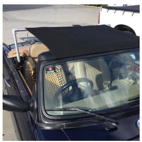
Fig 9 Mk 1 complete but not attractive