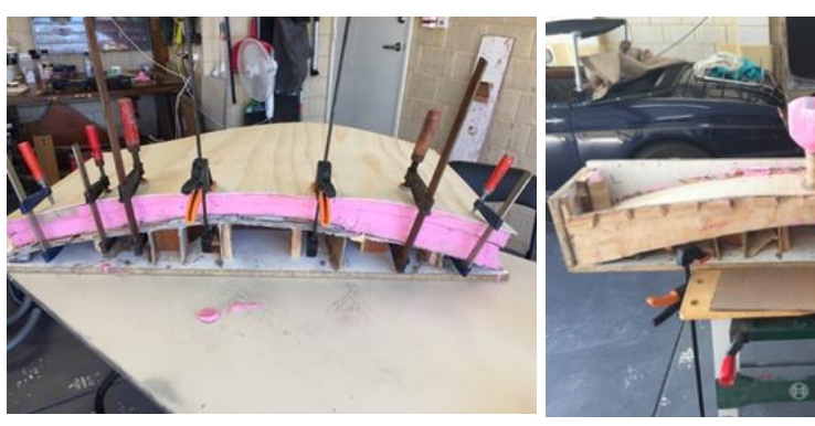
Fig 16 Ply and clamps save expensive rubber Fig 17 pouring second side