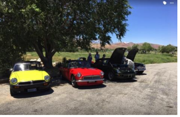
Figure 1: Heat respite in Death Valley

My interest in sun protection started some years ago through a family history of skin cancer