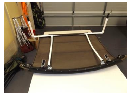
Fig 7 Mk 1 prototype frame with donor hood