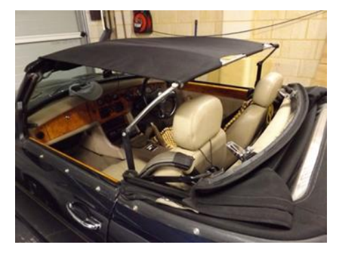
Fig 11 Mk 2 wit5h MGB frame