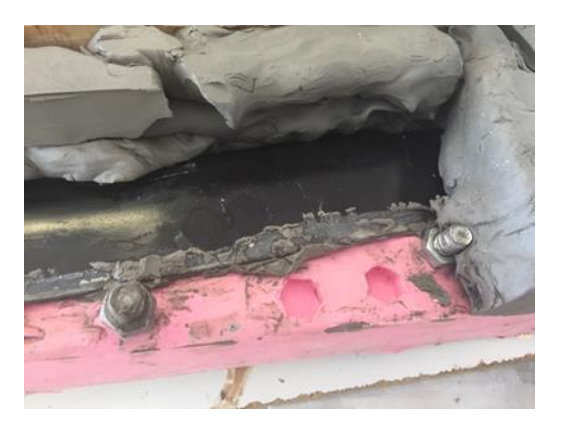
Fig 15 (below) showing bolts to create index points for mould halves

Fig 14 (left) cardboard tubes to pour silicone