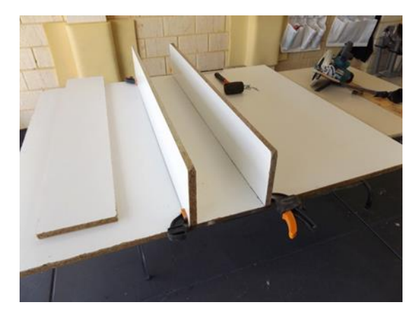
Fig 12 Mould box 18mm laminated particle board