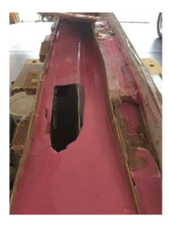
Fig 18 (left) oops - a $300 goof