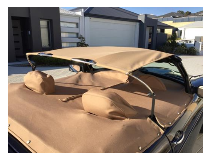
Fig 28 Finished RV8 Kanga Cover