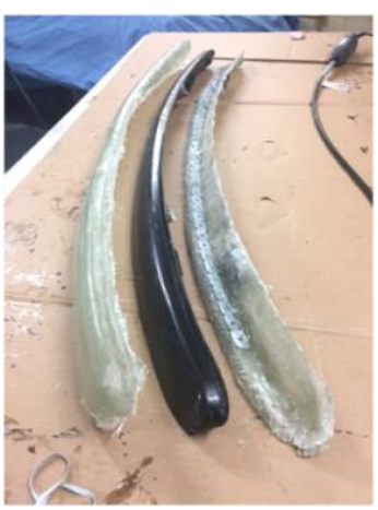
Fig 25 (right) two halves of header rail with embedded steel anchor points for fabric rail and jarrah blocks for clamps