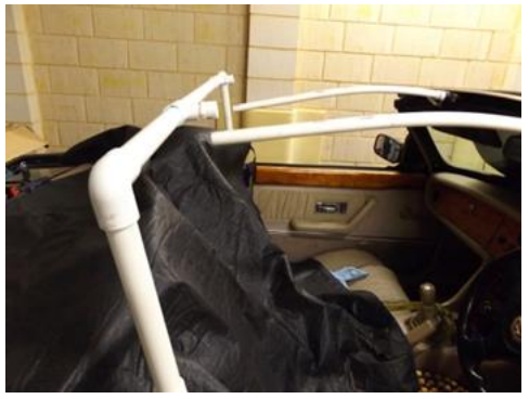
Fig 6 Mk 1 prototype PVC pipe frame