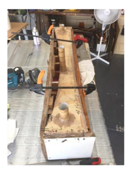
Fig 14 (left) cardboard tubes to pour silicone

Fig 15 (below) showing bolts to create index points for mould halves