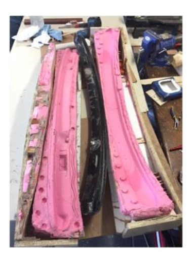
Fig 22/23 (below) mould box converted as support buck to prevent flexure of rubber during fibreglassing

Fig 21 (right) release agent assisted removal