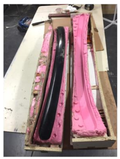
Fig 20 (left) steel donor with one half removed.

Fig 21 (right) release agent assisted removal