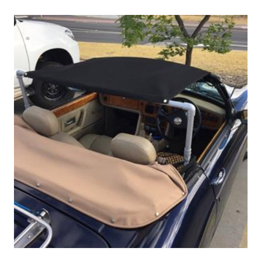
Fig 8 Mk 1 prototype concept works