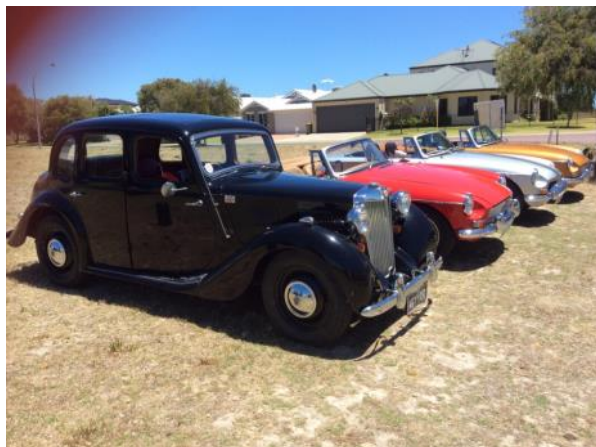
The line up of MG cars forming PGMGCC

All four of us live within a kilometre radius and the coffee shop is our unofficial meeting place.