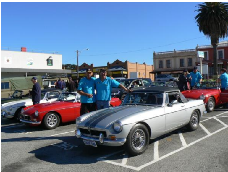
Rallying with friends in Albany, WA

The Albany Rally we competed in was our first real test for Marilyn – a road journey of over 400km just to get there – she came through with flying colours.