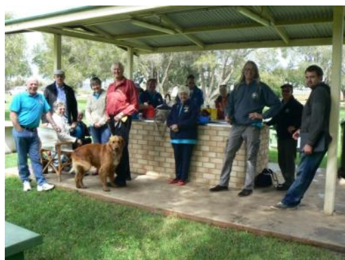
Morning tea during a local Car Club rally