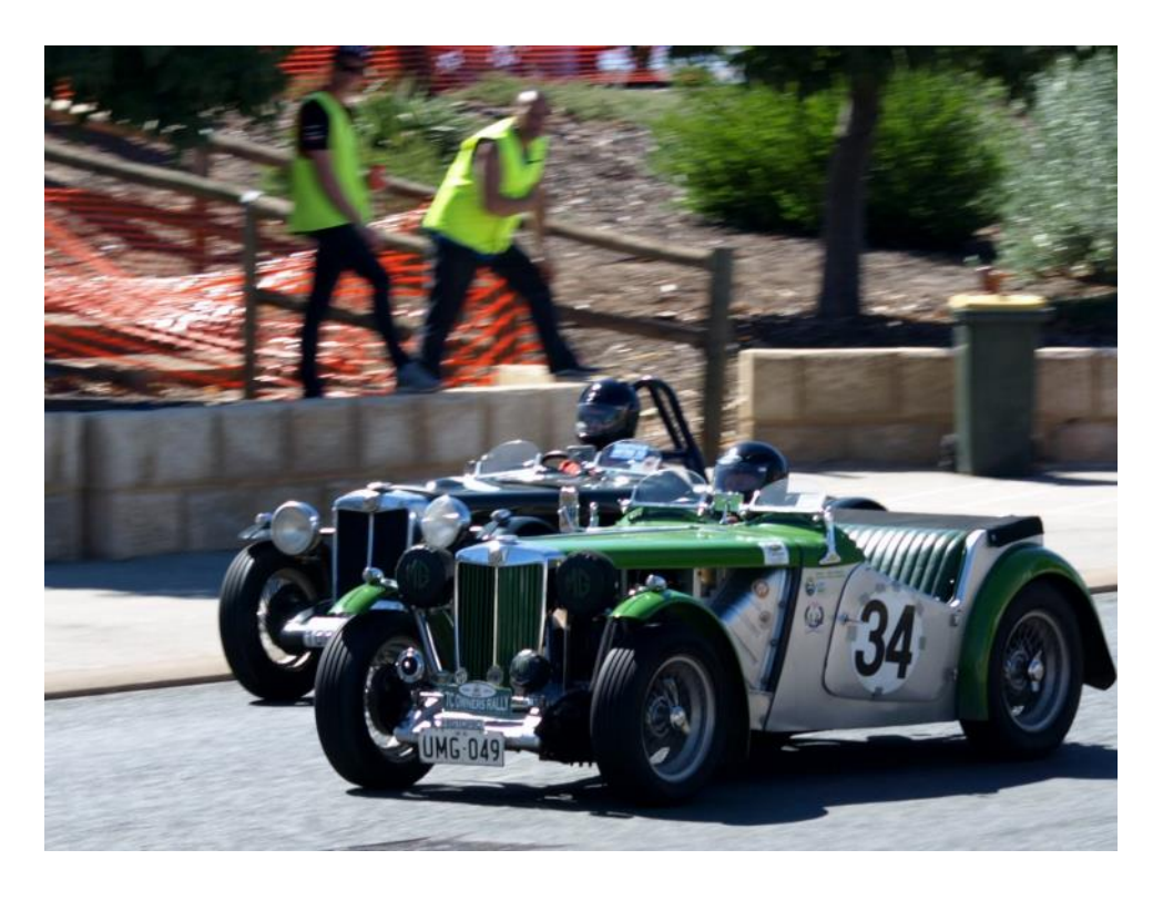
TC's battling it out down the main straight