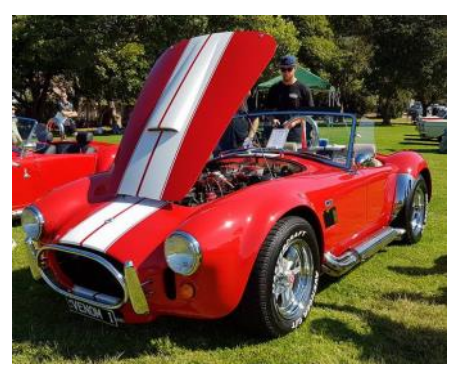
More cars from the Shannon's Classic Car Show