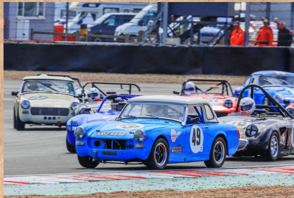
Competitive Action at Donington