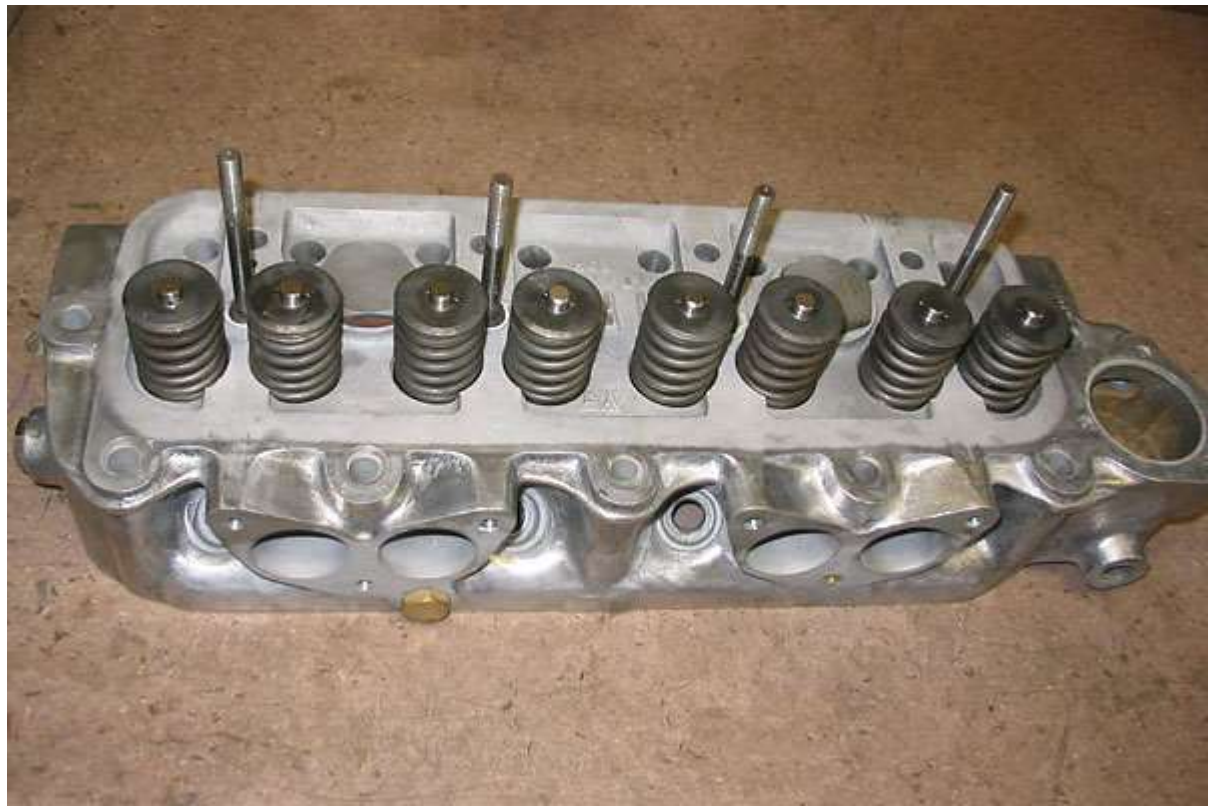
Do we have any Derrington-headed cars amongst our readers? - Let me know!