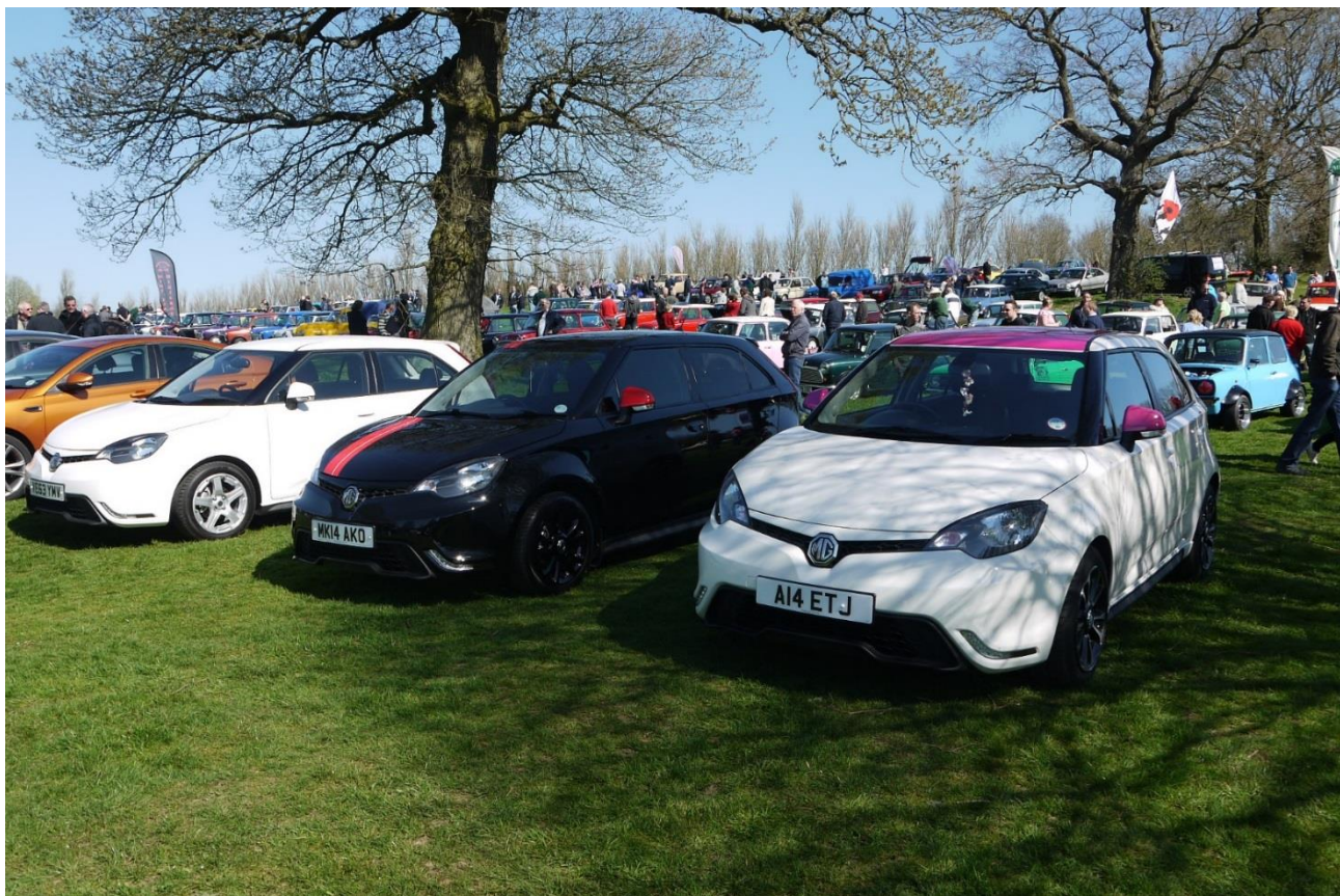
Pride of Longbridge 2015